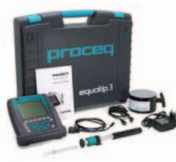
353 10 300 unit G