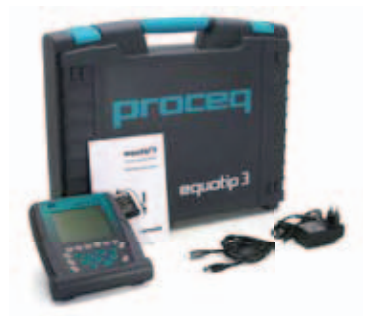
353 10 050 basic unit