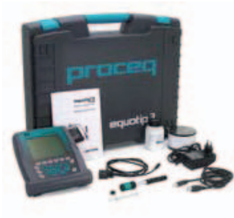
353 10 100 unit D

353 10 050 Equotip3 Hardness Tester, basic unit, includes Equotip3 indicating device, AC adapter, carrying case, USB-cable, USB-memory stick, operating instructions and quick reference guide. The customer needs to buy the appropriate impact device and test block in addition to the Equotip 3 basic unit