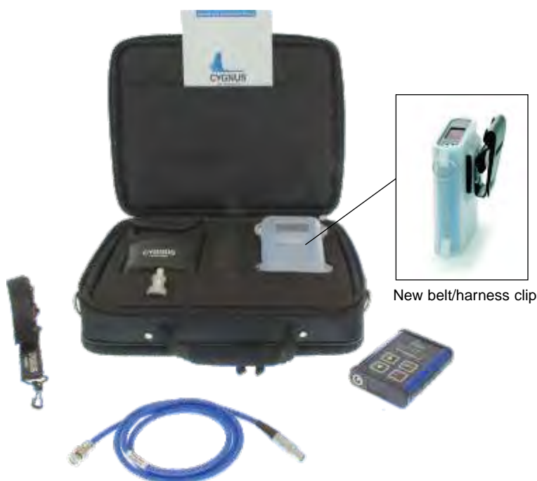
New belt/harness clip

Instrument, 2.25 MHz x 13 mm diameter probe, spare membranes, 15 mm steel test block, membrane couplant, ultrasonic couplant, accessory pouch, protective silicone sleeve with belt/harness clip, neck strap, operation manual, blue high flex probe cable and carry case.